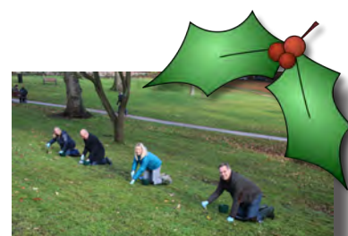
Staff from Harrison Drury Solicitors planted bulbs at lunchtime.