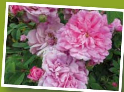
Roses: Duchesse de Montebello

Changes to the Square in the refurbishment meant we had to learn afresh which plants would thrive in the different locations.