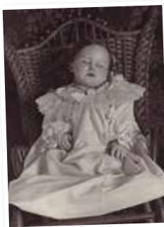
Victorian Post-mortem photograph

In 15 of the last 20 years of the 19th Century Preston had the highest Infant (under 12 months) Mortality rate in England. In 1893, 268 infants out of 1,000 died before reaching the age of one.