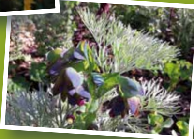
Honeywort with wormwood: Cerinthe major 'Purpurascens' and Artemisia 'Powis Castle'